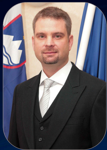
H.E. Tadej RUPEL Cyber Ambassador MFEA, Slovenia Moderator

With rising malicious cyber activities and intense international discussions, cyber diplomacy is evolving to address current threats and engage in global policy dialogues. The Western Balkans remains strategically important, as shown by ongoing investment in cybersecurity capacity building. This panel aims to define cyber diplomacy's role in enhancing security and peace in the region by exploring the roles of various capacity-building actors and identifying strategic partnership opportunities. It will focus on preventing cyber conflict, crisis management, and promoting international standards for secure cyberspace, highlighting successes and challenges in international cooperation.