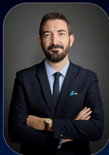
H.E. Vladimir VUČINIĆ Cyber Ambassador Montenegro Moderator

The panel will explore the ethical principles and measures taken by international organizations and national governments to ensure responsible AI development and use. It will discuss how AI is transforming the global security environment, highlighting efforts like the EU's AI Act and the UN's recommendations and resolutions on AI ethics. The panel aims to address the need for further action to prevent AI abuse in both civilian and military contexts, involving international organizations, national governments, and civil society.